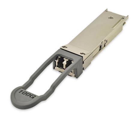
Figure 3: 100G SWDM4 QSFP28 Transceiver

SWDM technology also provides additional operational advantages with respect to proprietary bidirectional, or "BiDi", solutions addressing the same market need. The first advantage is supporting longer link lengths. The second is making network monitoring much simpler, since SWDM4 transceivers can be used with standard (not bidirectional) network taps and with standard transceivers on the monitoring equipment, unlike BiDi transceivers.